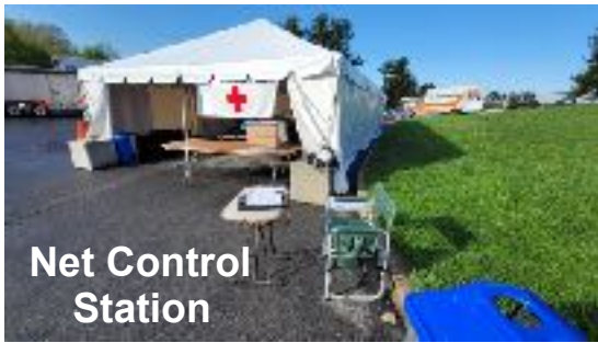
Net Control Station