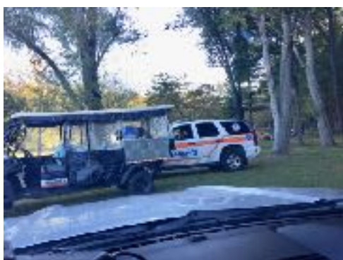
Net Control (left)