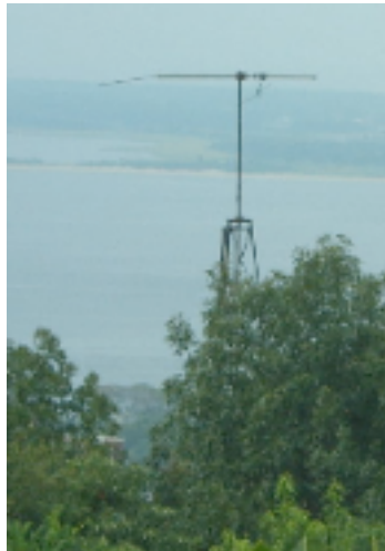
Marconi's antenna (above and right)