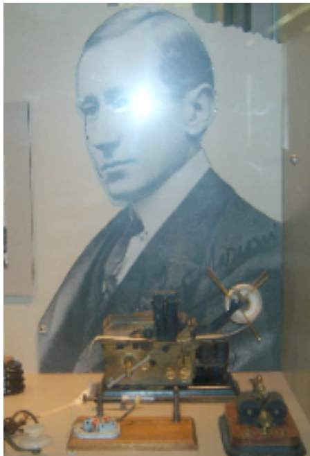
Marconi and his telegraph key (above)