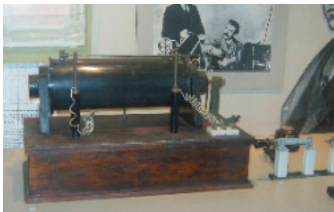
Marconi's spark generator (above)