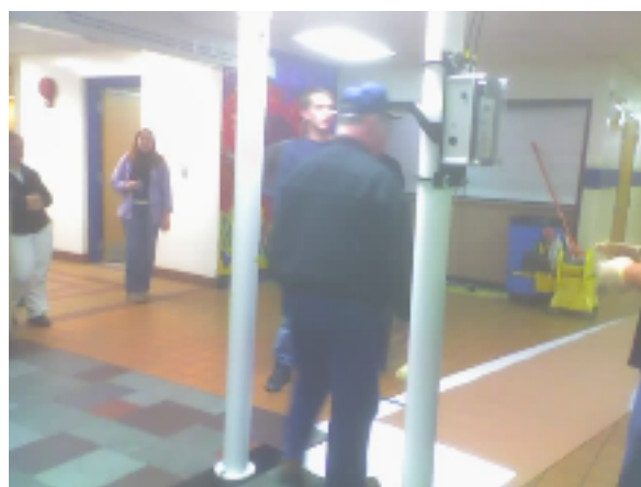
Portable radiation detector