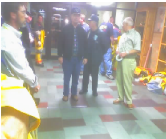
Limerick participants at Salisbury H.S.