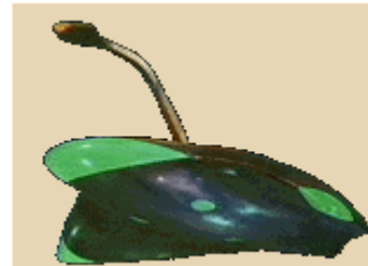
The Martian ship

What Lehigh Valley city was mentioned in the famous radio play, "War of the Worlds"? (1) Allentown (2) Bethlehem (3) Easton (4) Emmaus (Answer below)