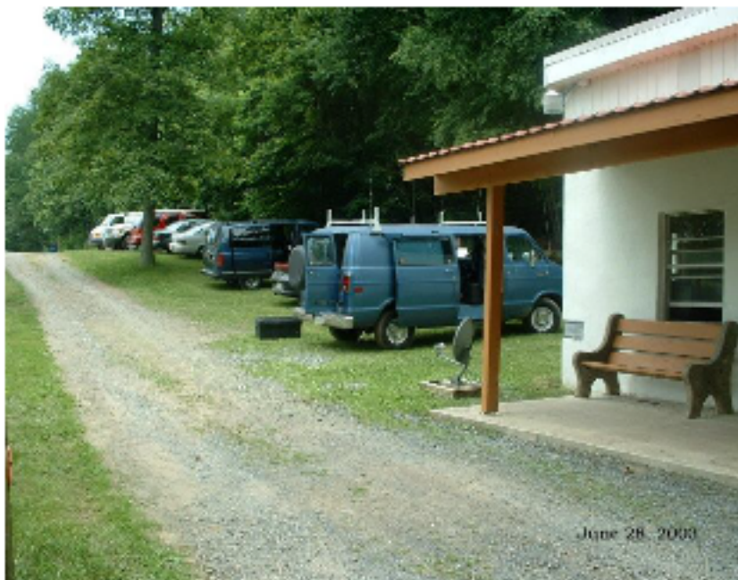
The Kitchen and "Bunk House"