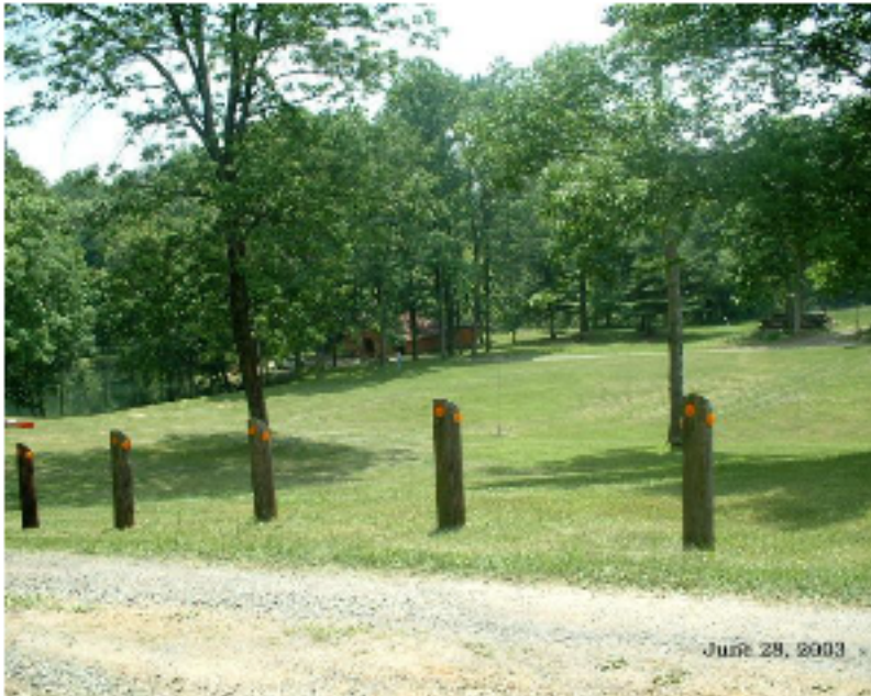
Entrance to Camp Serranova