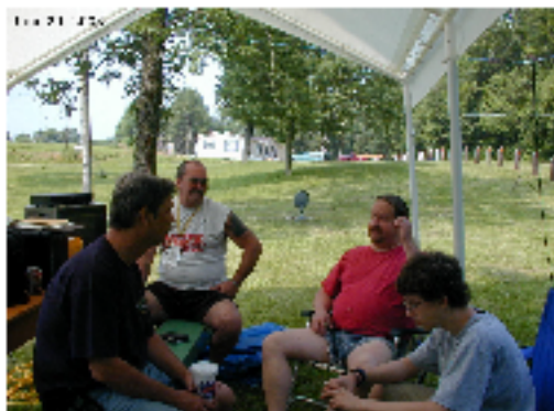
A quiet moment away from the radios, relaxing and chatting, of course, about ham radio !