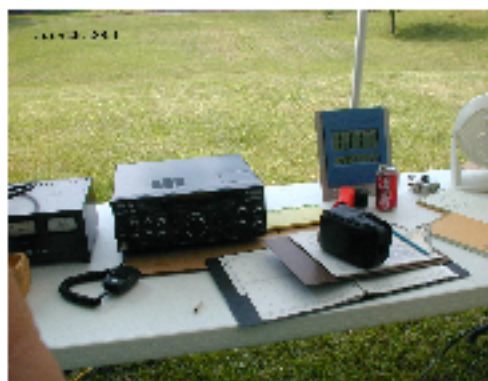
The club's radio